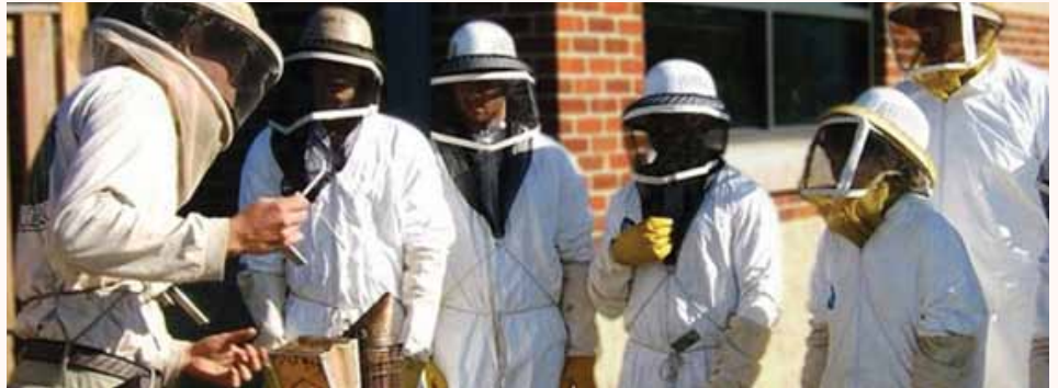
STUDENTS GATHER AROUND A BEEHIVE IN THE MARQUEE COURSE POLLINATORS IN CRISIS .

“It was a great concern to faculty that we had many brilliant students in other majors who will make science-related decisions in their jobs, and we were not offering courses to adequately prepare them.”