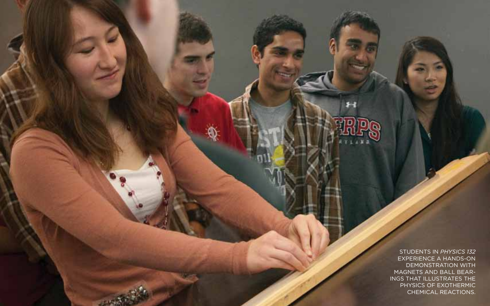
STUDENTS IN PHYSICS 132 EXPERIENCE A HANDS-ON DEMONSTRATION WITH MAGNETS AND BALL BEARINGS THAT ILLUSTRATES THE PHYSICS OF EXOTHERMIC CHEMICAL REACTIONS.