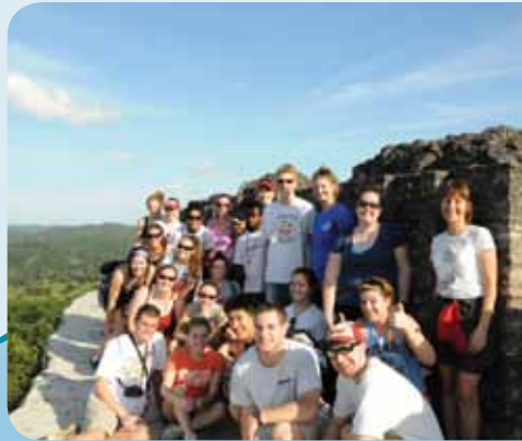
LIFE SCIENCES SCHOLARS IN BELIZE.

The programs feature special colloquia as well as supporting courses, which apply to students' general education requirements. Sophomores complete a practicum in which they engage in an internship, research or service learning project related to the theme of their program, then present their experiences